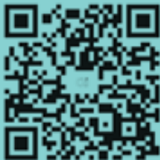
Read CRI online articles, “Clickety”

May 1981, Sheikh Hasina returned to Bangladesh after six years in exile. The day is historically significant in Bangladesh’s political discourse and popularly known as ‘Hasina’s Homecoming Day.’ CRI published a special article explaining the context and significance of “Hasina’s homecoming day.”