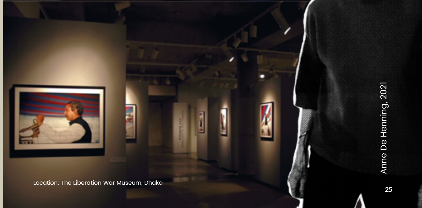
Location: The Liberation War Museum, Dhaka