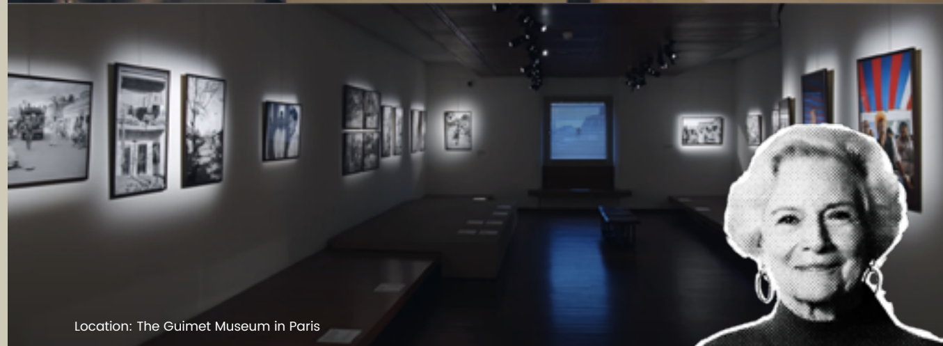
Location: The Guimet Museum in Paris